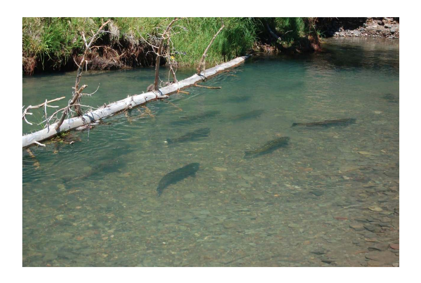
Review of the Lower Snake River Compensation Plan's Spring Chinook Program