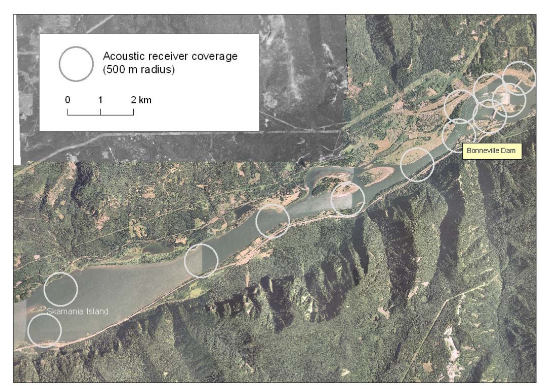
Figure 1. Aerial photo of the Bonneville Dam area with potential acoustic receiver locations shown. Additional detection arrays are located near Rkm 0, 53, and 140.