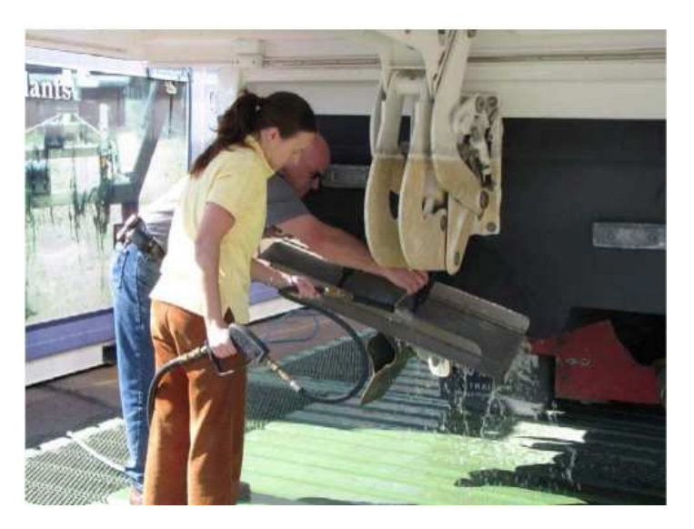
A boat being decontaminated

<u>Budget justification</u>: Current research at the Bureau of Reclamation on mussel resistant coatings are demonstrating costs that are three times greater than previously used coatings.