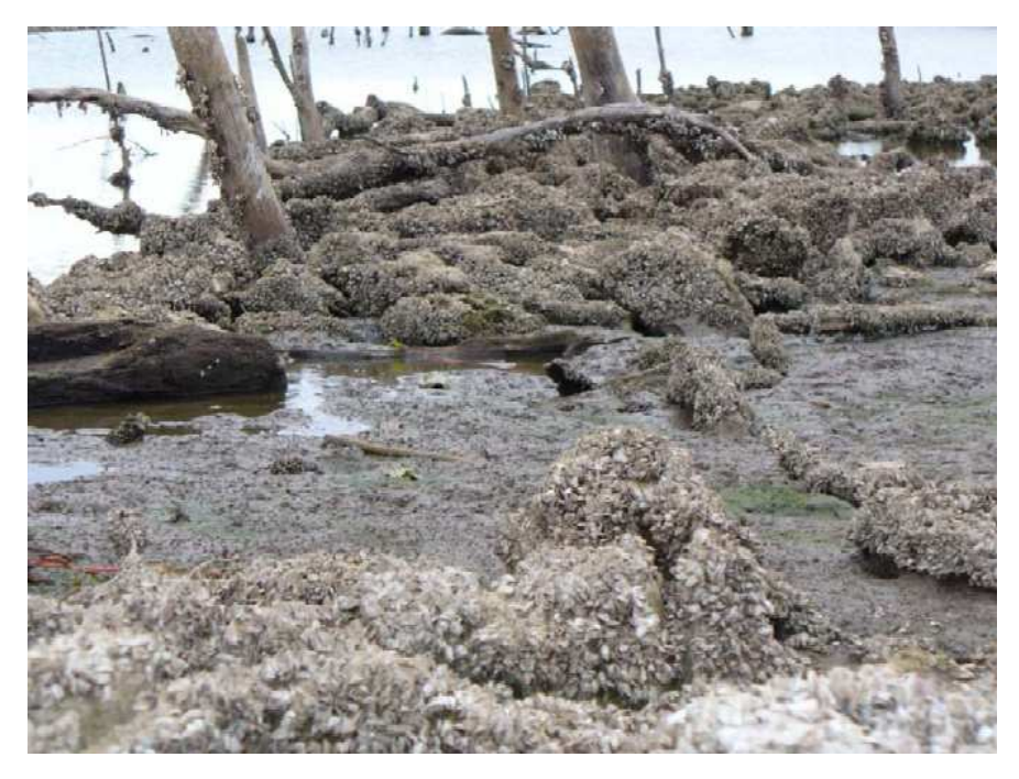
View of exposed zebra mussels at a Kansas reservoir after a lake drawdown.