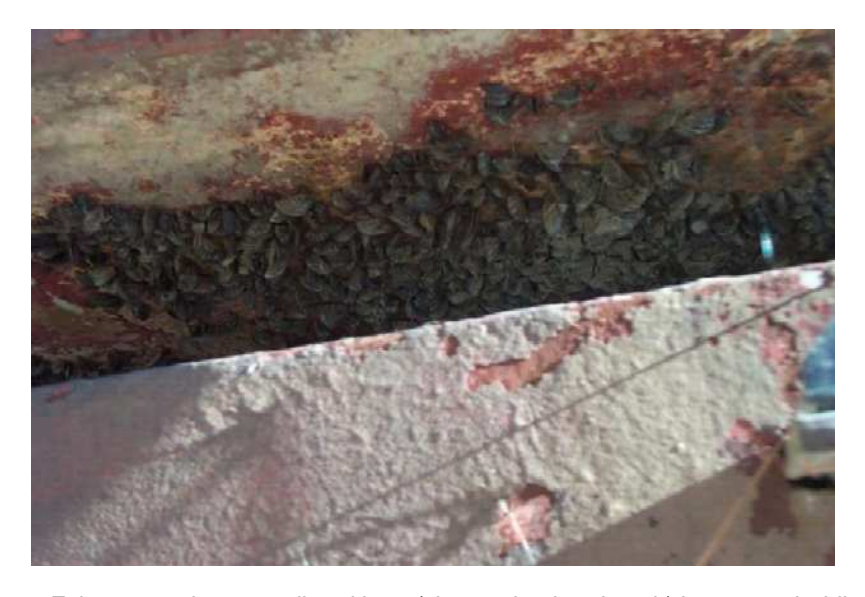
Zebra mussels on a trailered boat (view under the trim tab) intercepted while entering California in 2002.

For more expansive Dreissenid Biology and Background, please see Appendix C.