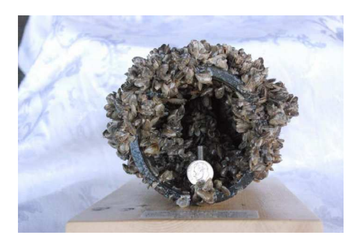
Pipe encrusted with zebra mussels.

A dedicated rapid response fund is necessary to rapidly implement containment at state or federal waters newly infested with quagga and/or zebra mussels. This fund would help States and other jurisdictions organize and begin implementing immediate actions while they work with