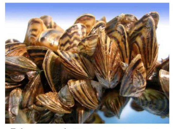
Zebra mussels (Dreissena polymorpha)