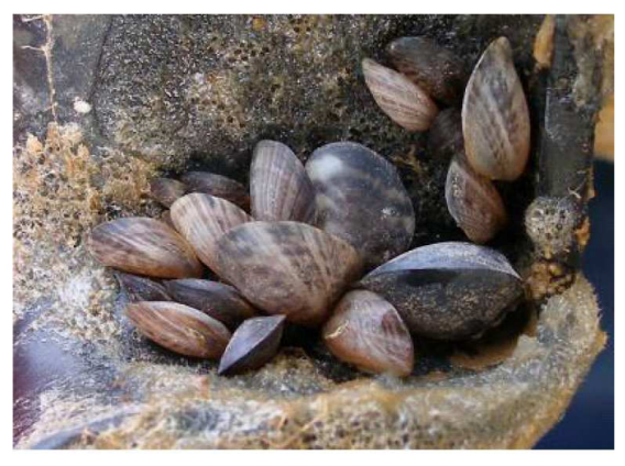
Quagga mussels (Dreissena bugensis)