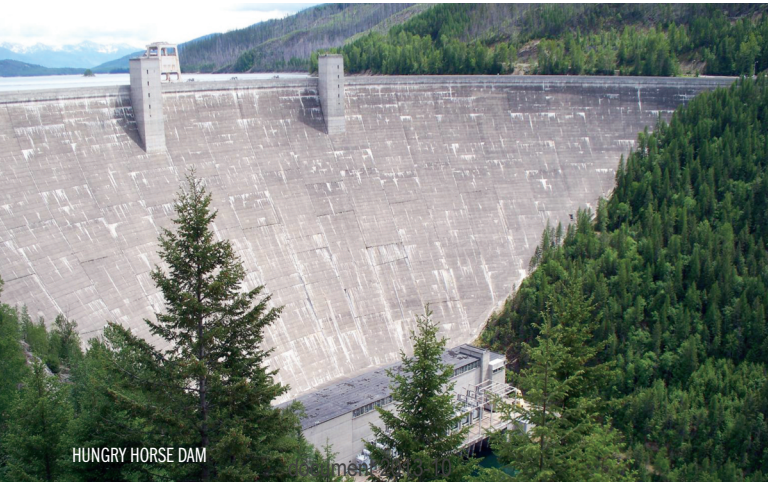
HUNGRY HORSE DAM

VarQ is a flood risk management (FRM) methodology developed in the late 1990’s and implemented in the early 2000’s for Libby and Hungry Horse dams in Montana. VarQ stands for variable discharge. It adjusts the wintertime drawdown in proportion to the forecasted inflow and then continuously regulates outflows in response to the observed inflows. VarQ allows dam operators to more reliably supply spring and summer flows for fish while simultaneously better ensuring higher reservoir elevations in the summer. It maintains the level of local and mainstem flood protection in the Columbia River as would occur under the previous procedure (standard FRM). In years when the seasonal water supply volume forecast is in the mid-range (between 80% and 125% of average runoff), VarQ allows more water to remain in the reservoir by the end of winter for multiple uses in the spring, summer and early fall.