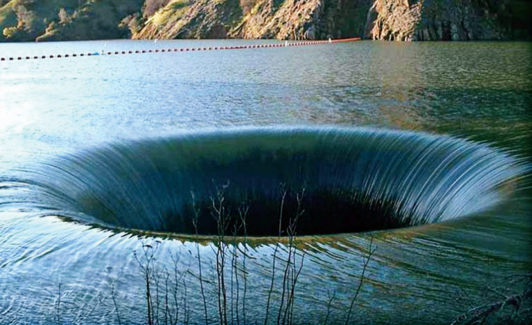
The glory hole spillway at Hungry Horse Dam is the highest in the world. Water cascades over the rim and drops 490 feet.

Horse and Libby dams. VarQ was made permanent at Libby and Hungry Horse dams by 2009, after an extensive Environmental Impact Statement process. These studies concluded that VarQ provided ecosystem benefits while maintaining the same FRM benefits as under standard FRM.