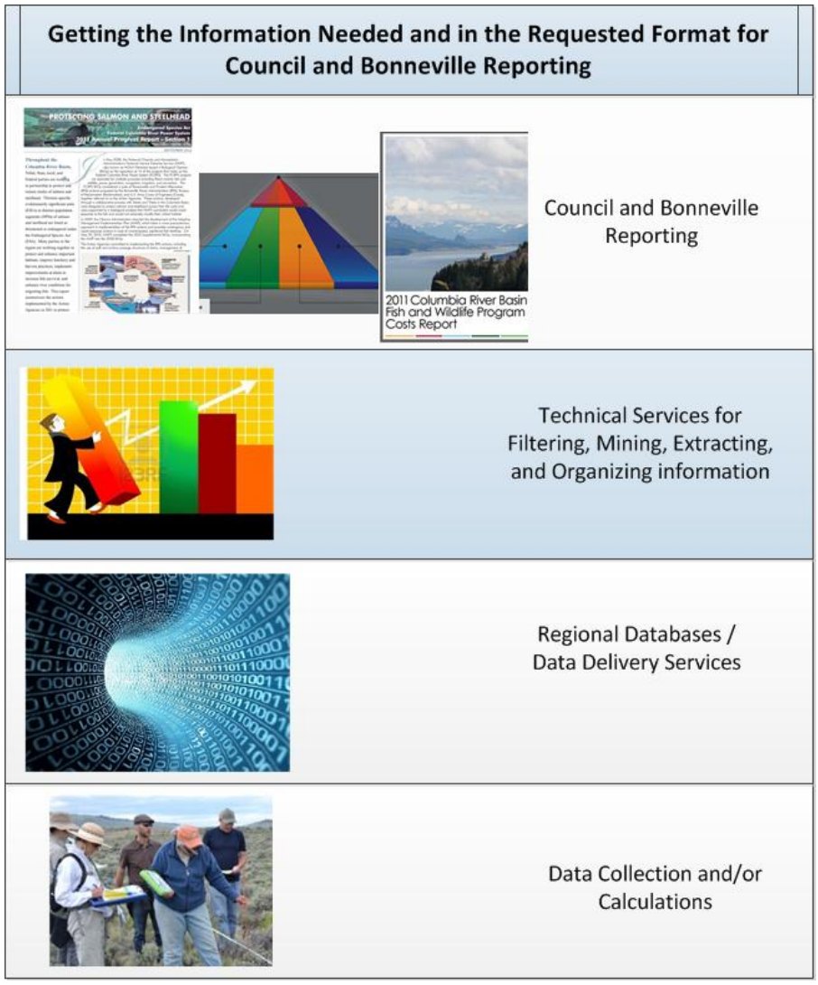
Figure 1: The role of the technical services is to ensure that the information needed for Council's and Bonneville's reporting needs are identified, located, organized, and available in the required reporting format.

The main function of the technical services work plan is to compile, filter, extract, organize and format the information needed for Council and Bonneville reporting needs (figure 1). The accessibility of these data vary depending on whether these are currently accessible as raw field data (e.g., redd counts) or as calculated estimates (e.g., population abundance), and whether this information is in a computer readable format (e.g., StreamNet) that is easily accessed to produce graphics, or a non-computer readable format (e.g., reports) that requires conversion to a computer readable format (e.g., excel spreadsheet).