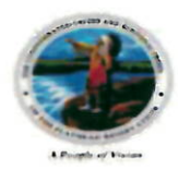
Confederated Salish and Kootenai Tribes