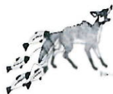
Canadian Columbia River Intertribal Fish Commission