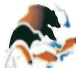
Okanagan Nation Alliance