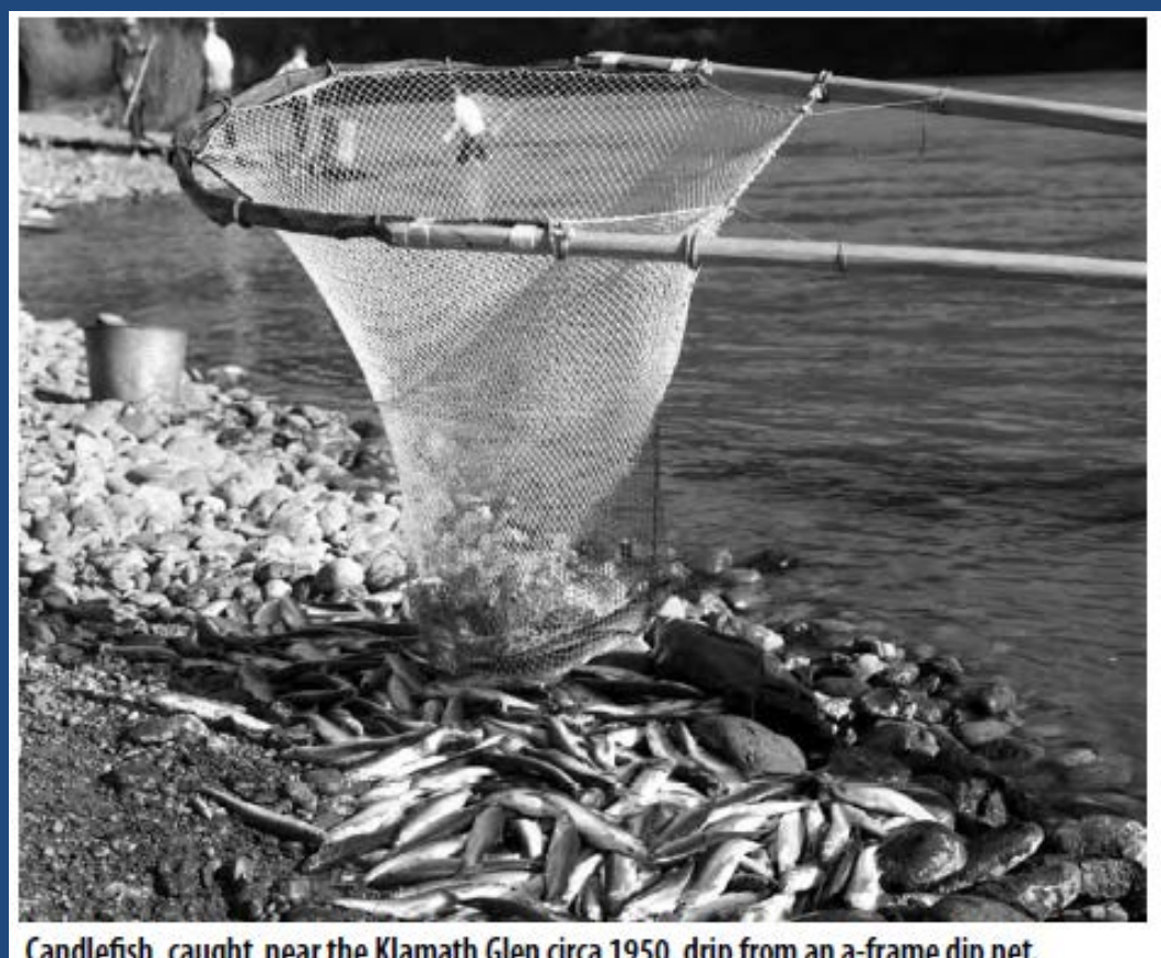
Candlefish, caught near the Klamath Glen circa 1950, drip from an a-frame dip net.

Research – Adult and Juvenile Eulachon Sampling on the Klamath River