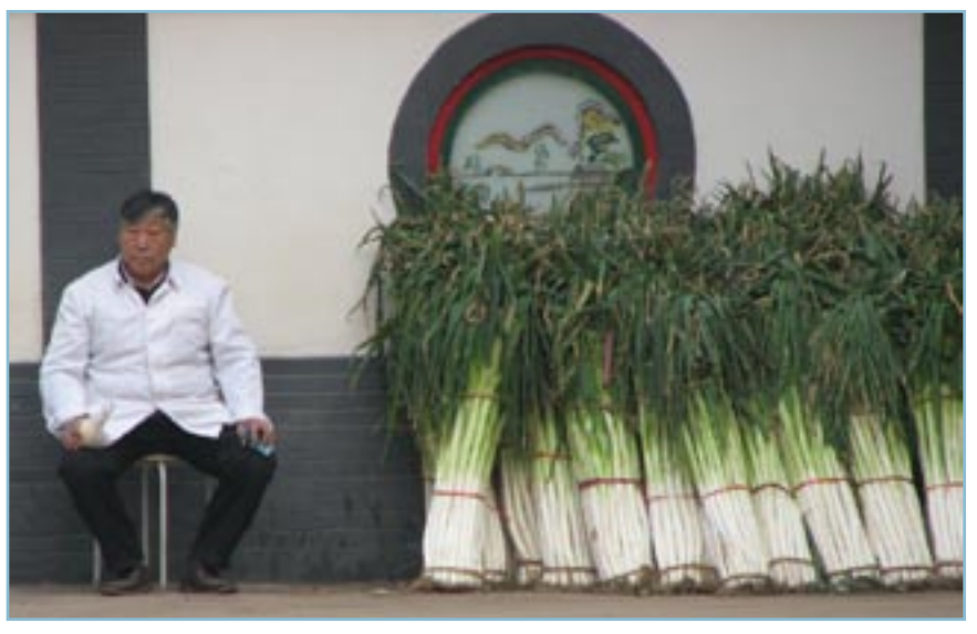
Vendor, in Beijing, selling leeks.

I urged the Chinese to take advantage of the fact that these dams don't yet exist. At this point, they can modify dam structures without having to remove concrete. No one has yet begun to rely on the dams' energy, so the economics of operational alternatives are less dire than they will be later. In the Columbia, this kind of flexibility is history. The Northwest's experience, I argued, demonstrates that modifying built