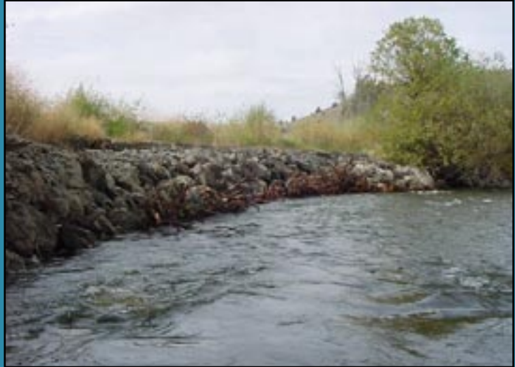
After streambank stabilization.