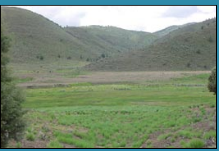
After noxious weed control.