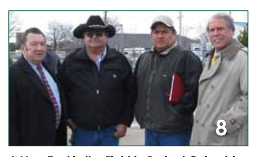
A New Tool in the Fight to Protect Columbia Basin Waters From Invasive Mussels The Shoshone-Paiute Tribes unveil a decontamination system for watercraft

That's a lot of new wind power developed in a short timeframe, which has created both opportunities and challenges. One of the biggest challenges has been the growing frequency of periods when wind and hydro generate more energy than we can use. The Bonneville Power Administration reported that wind generation on its system had passed a new milestone on February 22, reaching an all-time peak of 3,006 megawatts — that's enough electricity to serve a city three times