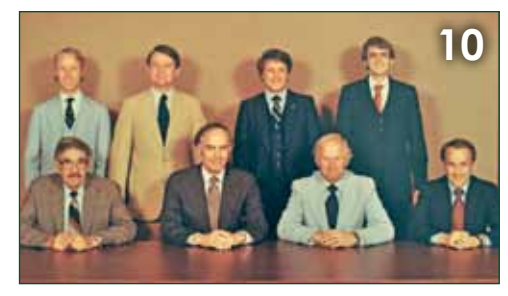
The Council's 30th anniversary Celebrating a milestone of regional cooperation