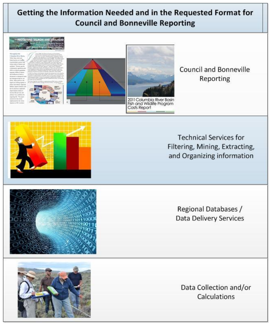
Figure 1: The role of the technical services is to ensure that the information needed for Council's and Bonneville's reporting needs are identified, located, organized, and available in the required reporting format.

The main function of the technical services work plan is to compile, filter, extract, organize and format the information needed for Council and Bonneville reporting needs (figure 1). The accessibility of these data vary depending on whether these are currently accessible as raw field data (e.g., redd counts) or as calculated estimates (e.g., population abundance), and whether this information is in a computer readable format (e.g., StreamNet) that is easily accessed to produce graphics, or a non-computer readable format (e.g., reports) that requires conversion to a computer readable format (e.g., excel spreadsheet).